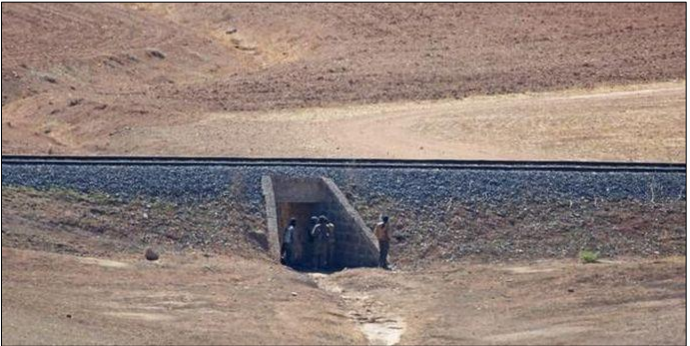
4 ISIS members who came by Turkish State's train are wearing their military equipments under Turkish soldiers escort. TV Channels broadcasted while ISIS members are crossing border from Turkey / Suruç to Rojava. Behind of the railroad is Kobani Region in Rojava.

Turkey is one of the countries who have primary responsibility for the existence, growth and spread of ISIS. The AKP government's offensive, sectarian and discriminatory foreign policy is criticized by almost the entire world today. This policy's role in the total war against ISIS in Kobane is quite noteworthy. And this foreign policy has mainly shaped by the initiatives toward Assad regime's collapse and preventing an autonomous Kurdish area in the region. Especially the mobility of ISIS members at the borders of Turkey and global jihadist reinforcements coming from Turkey borders lead the expansion of the threat and pose a more serious threat for the peoples of Middle East.